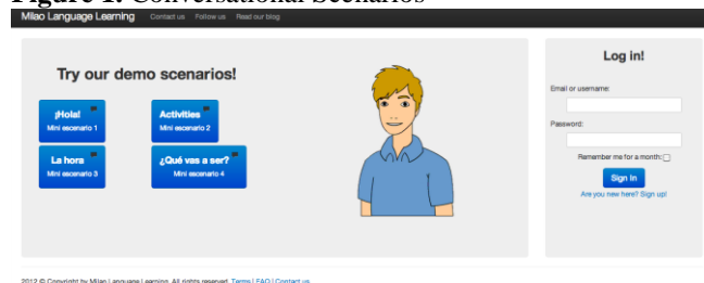
Figure 1. Conversational Scenarios

b) Interaction Dialogue Strategies : The goal of this task is to analyze, study and organize the interaction strategies that model and control the dialogue in the corresponding learning scenarios. It is important to attain balance between practical and theoretical motivation on this analysis, as we have to detect lexical and grammatical patterns in relation to the specific characteristics of the learner's Source Language. The strategies will be organized in three major categories: