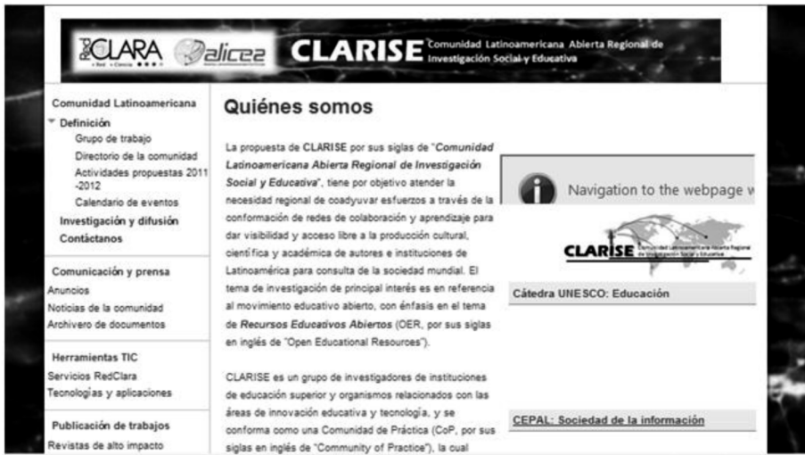
FIGURE 3 : CLARISE Portal (Web page https://sites.google.com/site/redclarise/ )