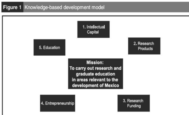
FIGURE 1: Development model based on knowledge (Cantú, Bustani, Molina, and Moreira, 2009)

Chairs are research groups supported by a capital provided by the institution, and to carry out their research projects, chairs complement this capital with external resources obtained from companies, consultancies, research projects organized by national and international public bodies. Figure 1 shows the organization model of chairs for knowledge production.