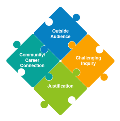
Figure 1. Authentic learning experience elements (Laur, 2013, p. 5)

Project-based learning (PBL) is an active instruction method that emphasizes student-led investigations, goal setting, teamwork, communication, and reflection within real-world contexts (Kokotsaki et al., 2016). It promotes the students' learning engagement, participation, and collaboration (Clark, 2017). It also offers an authentic learning experience, where students conduct a real-world investigation (Laur, 2013). She defines the authentic learning experience as purpose-driven investigation, extended learning, process-oriented knowledge, expert involvement, innovative, learner-focus, self-directed, and engaging practices.