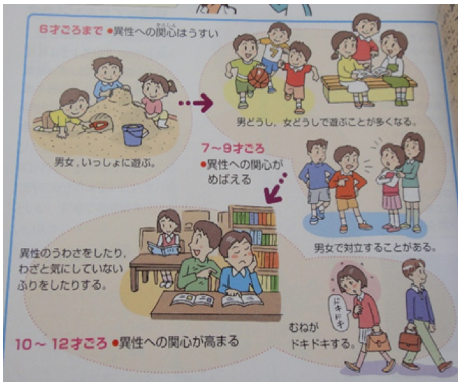
Figure 1. Girls and boys relations

girls reading a book is subtitled, “It becomes more common for boys and girls to play among themselves”. The lower image contains the caption, “Boys and girls often quarrel”. In the third phase, “ Approximately 10-12: Interest in the opposite sex grows ”, a girl is shown reading in the background, while two boys chat in the foreground. This image is entitled, “One gossips about the opposite sex, intentionally pretends not to have interest, and so on”. In the final image a girl is shown having passed by a boy and experiencing a reaction to him, the caption reads, “Your heart beats wildly”.