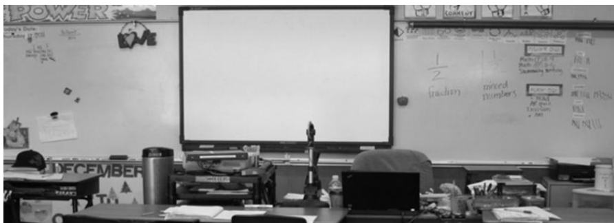
Figure 3. Image of vantage point in the classroom at Flynn Elementary.