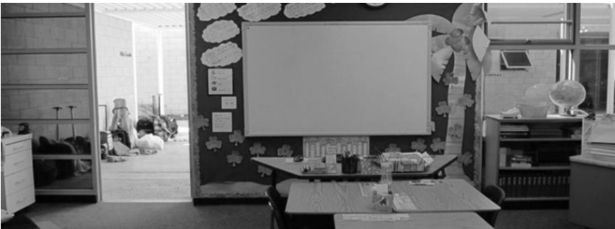
Figure 4. Image of vantage point in the Foley School elementary classroom.

The Foley School is the third and final school site in the study. Foley is a private school with predominately white students from wealthy families. The school has approximately 600 Pre-Kindergarten through 8th-grade students. Classes average 20 students per teacher, with teacher assistants in the majority of classrooms. Yearly tuition is over $16,000. The grounds at the Foley School are well cared for with lush greenery and flowers strategically placed throughout the campus; the buildings are freshly painted and architecturally appealing. Classrooms are well decorated with posters and student work. The school invests a significant amount of its funds in technology and technology education. The school offers an up-to-date computer lab, and several mobile computer stations, equipped with 20-30 laptops, that are moved from class to class depending on the teachers' needs for lessons. Upper-year students, trained in Adobe software, become familiar with architectural design software as well as photo and video editing programs. Curricula for primary and lower year students – among those whose classroom I observed – expose them to technology developmentally through learning how to use applications, navigating computer document management, and engaging in instruction via the interactive whiteboard in class.