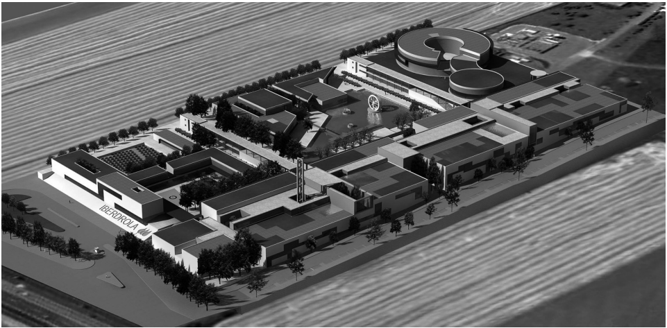
Figure 3. Project of the new «Educational & Sustainable Campus», Madrid (2007).

The Educational and Sustainable Campus, Madrid (Spain), 2007