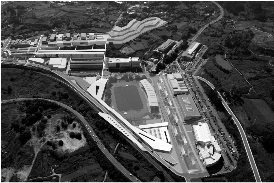
Figure 5. Project of the new «Educational Campus» (Elviña Campus - EHEA-Pavilions), University of A Coruña (2009).

was recipient of the Award «Campus of International Excellence» by the Spanish Ministry of Education, also falls into this research category.