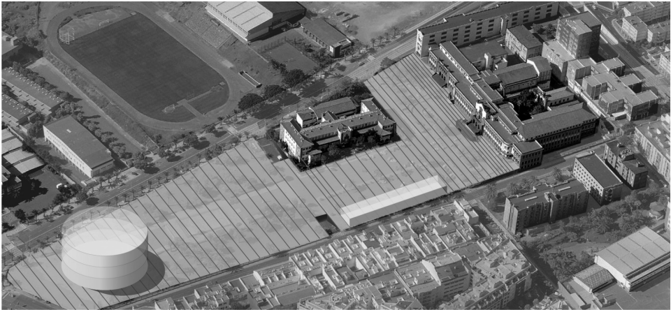
Figure 4. Project of the new «Educational Campus». (Learning & Research Resources Center), University of La Laguna (2009).

In 2009, the institution planned the requalification of its central space (adjacent to the Plaza Cruz de Hierro ). To achieve a sound transformation of this traditional location, the university decided to renovate the great open space, removing the current parking lots and redesigning it as a new pedestrian environment (enclosing a new botanical garden). In order to reinforce this urban nucleus, a new building will be erected: a Learning and Research Resources Center. The outcome of such a modern transformation will be the birth of a big urban and academic agora , that will exemplify the close union between university and city.