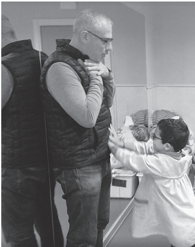
Figure 1. Variance of the Heimlich maneuver, out of the official guidelines, taught and assessed in the Program “RCP desde mi cole”

Descriptive statistics of the items were analyzed. We analysed the item-test correlations (discrimination index) of each item, with them being considered suitable above .20 (Muñiz & Fonseca-Pedrero, 2019). To study the internal structure of the scale, it was performed an Exploratory Factor Analysis (EFA) on the polycorrelation matrix, using Unweighted Least Squares as the method of estimation. Also, KMO and Bartlett tests were applied to study the adequation of the data to the Factor Analysis. The number of factors to be extract was determined by the optimal implementation of the Parallel Analysis (Timmerman & Lorenzo-Seva, 2011). As fit indices, Goodness of Fit Index (GFI) and Root Mean Square Residual (RMSR) were the chosen ones to be more appropriate with independence to the estimation method (Ferrando & Lorenzo-Seva, 2017) -being GFI >.95 y RMSR <.08 (Hu & Bentler, 1999) a good fit. In addition, we used Unidimensional Congruence (UniCo), Explained Common Variance (ECV), and Mean of Item RESidual Absolute Loadings (MIREAL) to examine how well the data fit a single dimension. The following values support treating the data as essentially unidimensional: UniCo >.95; ECV >.85; MIREAL <.30 (Calderón-Garrido et al., 2019). The reliability of the scores was analyzed following McDonald’s Omega Coefficient.