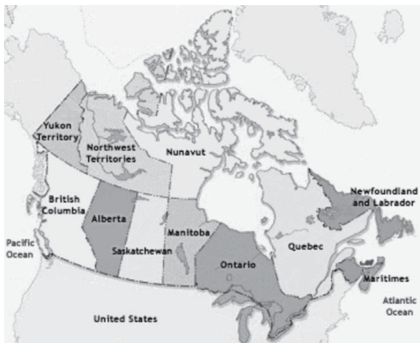
Figure 1. Map of Canada