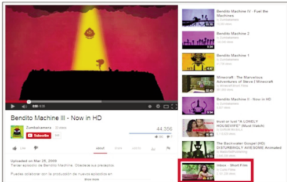
Figure 3: Section from the 'Bendito Machine III' YouTube page showing recommended videos.

The entanglement of human user and non-human algorithm also manifests in the 'recommended videos' section of the YouTube page. This list of associated videos appears to the right of the video currently being viewed (see fig 3), and is determined using a broad range of data, including video meta-data, the previous activity of the logged-in user, as well as the previous behaviours of other YouTube users who also viewed the current video (Davidson et al. 2010).