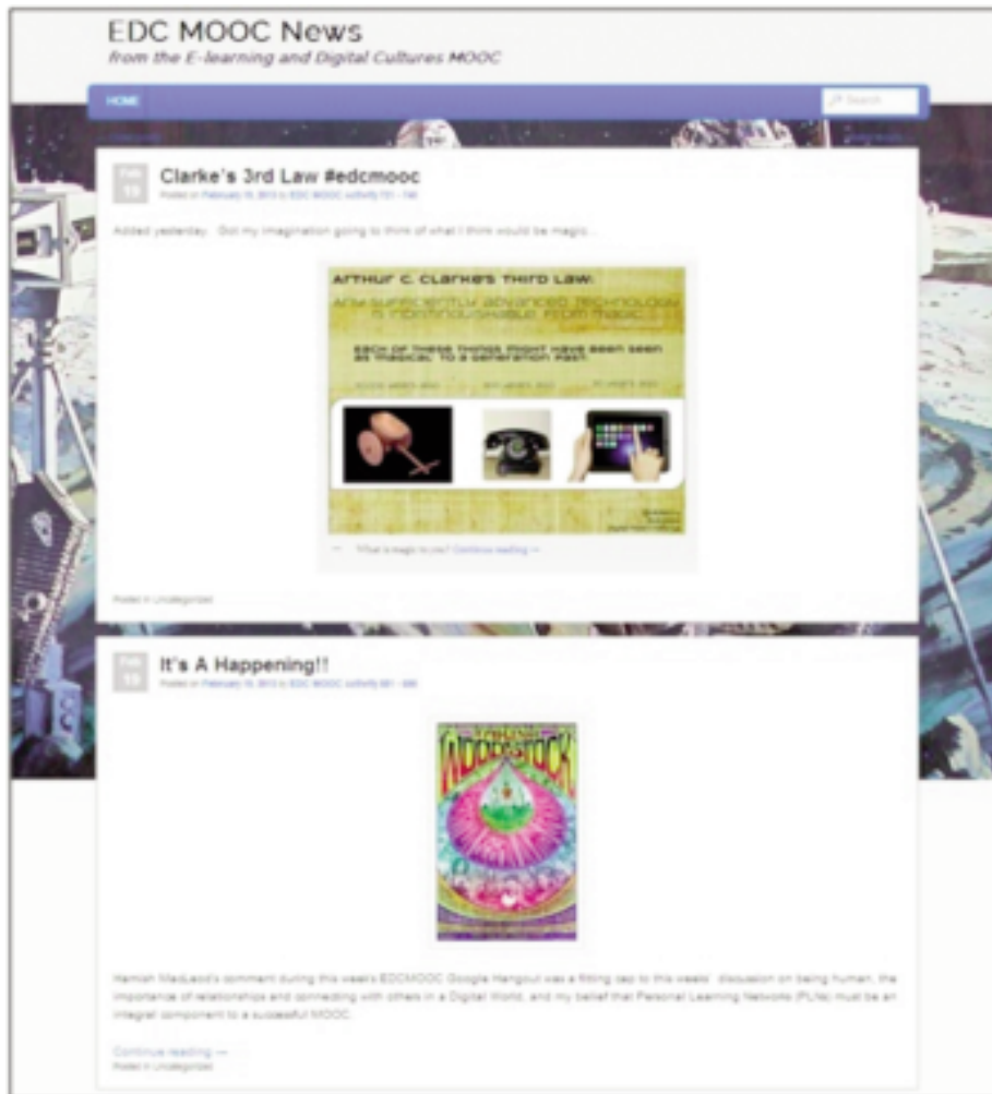
Figure 4: The EDCMOOC News WordPress site, showing two posts aggregated from distributed EDCMOOC participant blogs.

One of the foremost spaces of the EDCMOOC was the 'EDCMOOC News' blog aggregator (see fig 4). This bespoke system developed by the teaching team utilised a range of freely available web services to collate, combine and display posts from the personal and distributed blog sites of individual participants. Blogging was considered to be one of the primary activities in the EDCMOOC, and rather than being secondary to the teacher-curated material, participant responses were promoted as a central resource (author removed for peer review 2014). In this way, the EDCMOOC News constitutes an important space for the discussion of centralisation, distribution and aggregation.