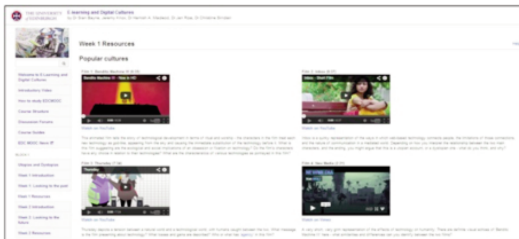
Figure 1: Section of the EDCMOOC week 1 resources page showing embedded YouTube videos.

However, looking beyond the categorisations of cloud computing or learning platform, the following analysis will attempt to show how the space of the EDCMOOC is produced in practice. The resource pages of the course offer a noteworthy example of the complexities engendered by combining platform and social media services. Instead of producing video lectures, the EDCMOOC embedded a range of public domain YouTube videos within the Coursera site (see fig 1 for week one), and combined with open access journal papers and articles, these constituted the primary resources for the MOOC. Utilising material that already 'existed' elsewhere on the open web meant that the Coursera platform pages became a conduit for the movement of participants to and from wider social media.