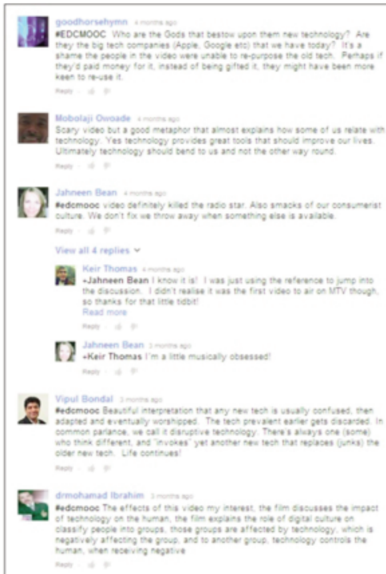
Figure 2: Section from the comments in YouTube underneath the video 'Bendito Machine III', used as a resource in the EDCMOOC.

The course hashtag is clearly visible in many of the comments, filtered within You Tube to show ‘top comments’ (see fig 2). This demonstrates how EDCMOOC participants were moving between the Coursera platform and social media. For these students, engagement with the EDCMOOC was shifting and fluid; experiencing resources in different settings and participating in discussion across and between different channels. Research which attempts to make sense of such experiences and arrangements might therefore focus on ‘flow and connectivity rather than location and boundary as the organising principle’ (Hine 2000, p64). What I suggest to be significant in this example is not the centralised platform or the use of public social media, but the practices of moving between them. What this calls for is a shift away from thinking about these technologies as innately location specific or inherently distributed, and towards the idea that their spatial qualities are produced in practice.