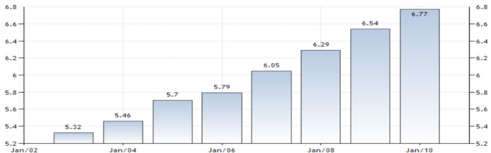
Figure 2. Tertiary gross enrollment ratio.

Do developing countries with lower tertiary enrollment rates face the same issues with respect to the transition to universal access? Figure 2 shows the region with the lowest tertiary gross enrollment ratio.